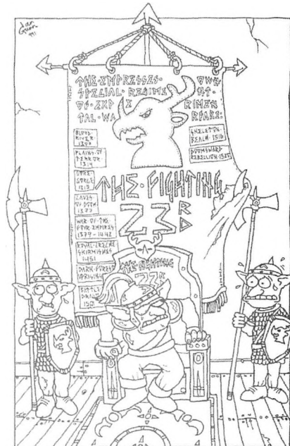
MASHAP IN THE REARRING, FIGHTING ZEP

A WOOF collation will take place at Aussiecon 4. Please bring 100 copies of your contribution to the labelled box in the convention Newsletter office (probably on the ground floor) by noon Sunday. The collation will take place in the at room at noon on Monday, unless advised otherwise.